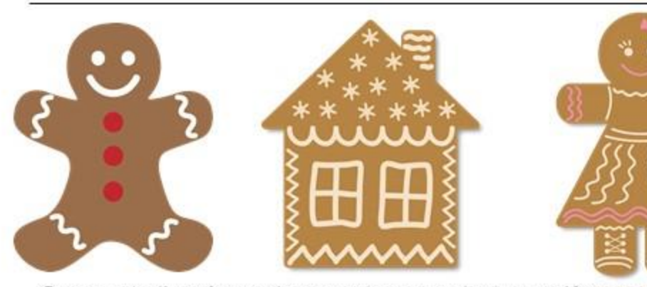
© 2020 Jodi Jill Not for Resale. Cannot be reposted online. Feel free to copy and share! www.puzzlestoplay.com

The words appear UP, DOWN, BACKWARDS, and DIAGONALLY. Find and circle each word.