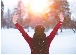
LIVING THE CELEBRATION COMPANY'S COMING WORSHIP SERIES